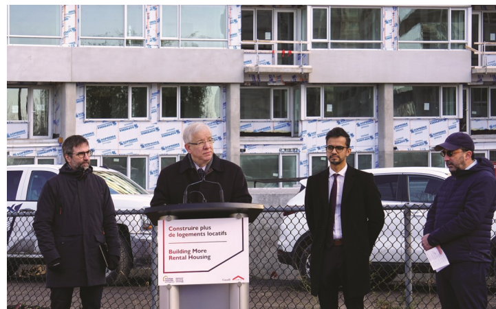
At an announcement of CMHC low-cost financing to build 3,000 new rental housing units in the Montreal region including in Pierrefonds

The federal government continues to invest to accelerate residential home construction with a view to adding at least 100,000 new residential units across Canada over the next four years. More specifically in Quebec, the federal government will invest $900 million — representing nearly 23 percent of the total it is investing across the whole country. This sum will be matched by the province under a recently-signed bilateral agreement, bringing total funding for new home construction in Quebec to $1.8 billion. With this new federal-provincial funding, we can expect to see over 23,000 more units than normally anticipated by 2027-2028; including 8,000 new social and affordable housing units, of which 500 will be for those who are homeless or at risk of homelessness. Already, $1.7 million from this new funding has been earmarked for the West Island's Ricochet social housing project which will serve young adults with low income and people struggling with mental health challenges.