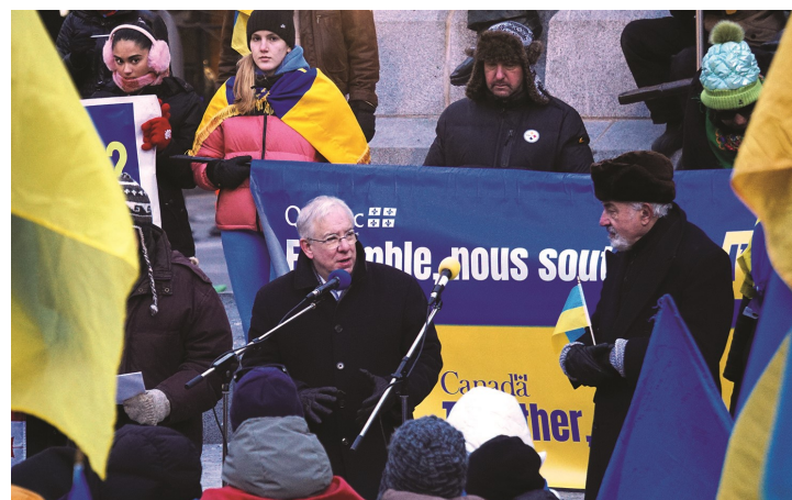
Speaking at a rally in support of Ukraine on the second anniversary of Russia's full-scale illegal invasion

The FCAC expects banks to help individuals who may be struggling to pay their mortgages due to exceptional circumstances. Finance Minister Chrystia Freeland's Fall Economic Statement introduced the new Canadian Mortgage Charter listing specific guidelines on how financial institutions are required to treat vulnerable borrowers who are struggling financially.