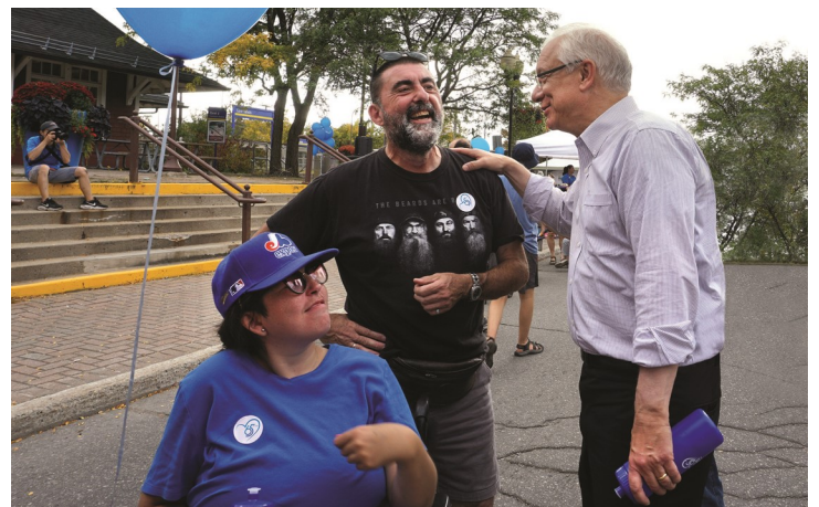
Attending WIAH's 65th anniversary celebrations