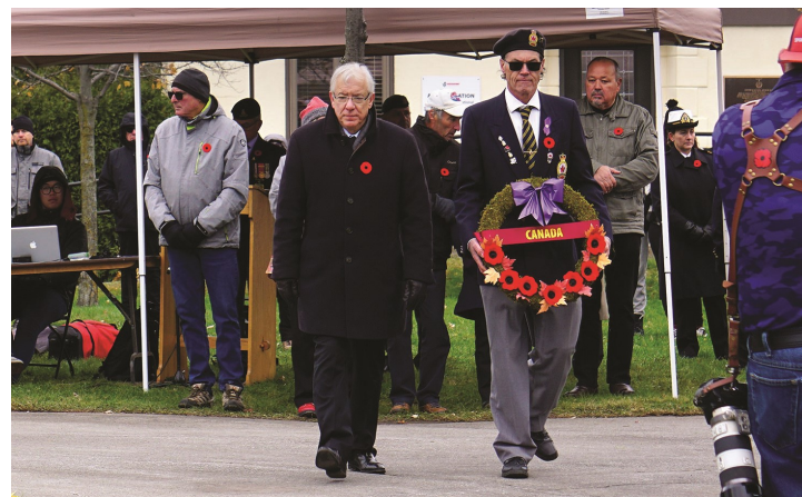
Laying a wreath at the National Field of Honour on Remembrance Day

The portal acts like a search engine that can pinpoint helpful resources by allowing the user to specify their goals and the kinds of resources they need. Goals can include conducting R&D, starting or buying a business, buying or leasing equipment or property, growing and expanding a business, hiring and training employees, reducing pollution, and increasing productivity. The portal can identify resources such as grants, loans, tax credits, and wage subsidies. It can also help with partnering, hiring interns and accessing expertise such as researchers. To access this valuable tool, enter "Business Benefits Finder" in your search engine's search bar.