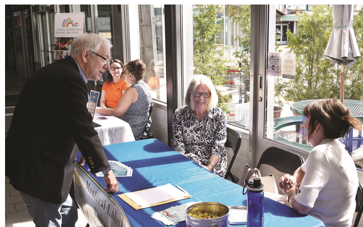
At Community Awareness Day at Plaza Pointe-Claire with members of the Lakeshore University Women's Club