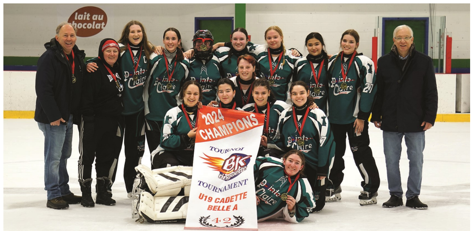
At the BKRA annual ringette tournament with U19 champions Pointe-Claire