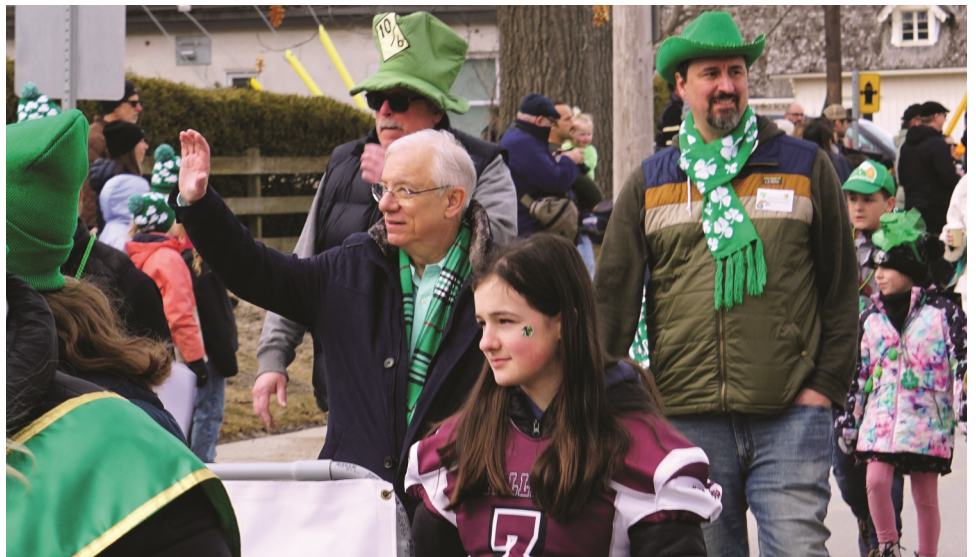
Taking part in Hudson's St. Patrick's Day Parade